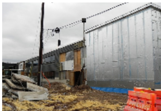
Exterior North Wall Unit J