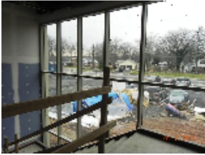
New Stairs Old District Office