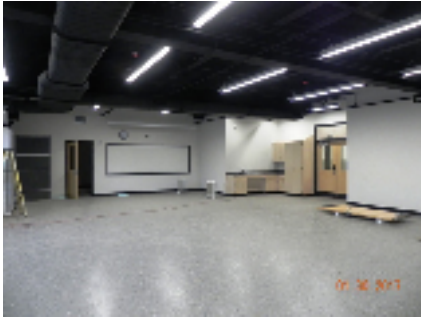
Tech Ed (Boiler Room)