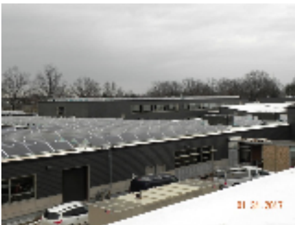
Coiling Door and Corner of Walkway