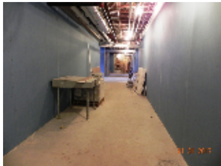
Unit J 1st Floor Corridor