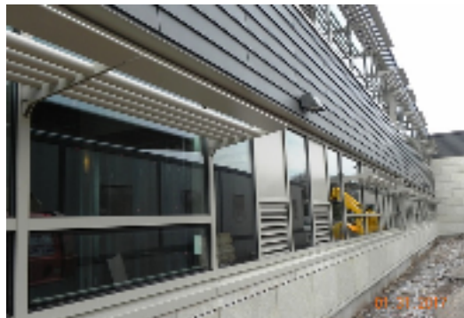
Exterior South Wall Unit J