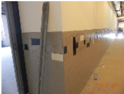
Unit J—2nd Floor Corridor