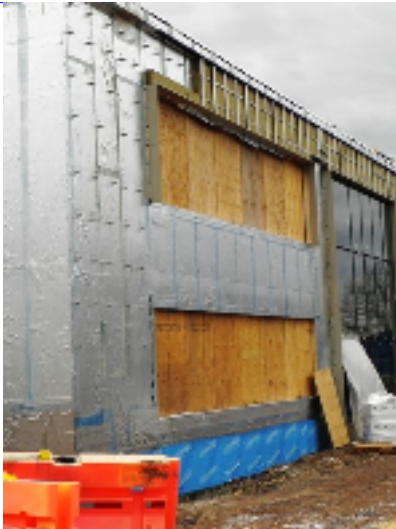
Exterior West Wall Old District Office

First Floor 10 Classrooms 1 IPC 1 Seminar Room 1 IT Closet 1 Electrical Closet Second Floor 3 Physics Labs 7 Classrooms 1 IPC 1 Seminar Room 1 Electrical Closet