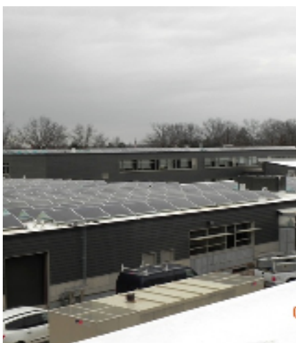
Exterior South Wall - Tech Ed