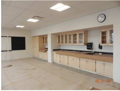
Physics Lab 2nd Floor