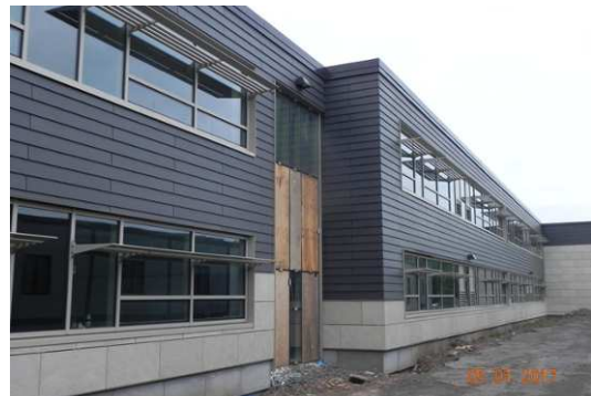
Exterior South Wall Unit J