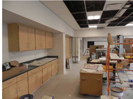
1st Floor Double Classroom with Partition