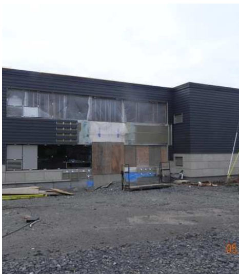
Exterior North Wall Final Section of Rainscreen

Unit J is Closed In (Final Wall to finish)