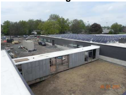
Connecting Corridor Looking at East Side