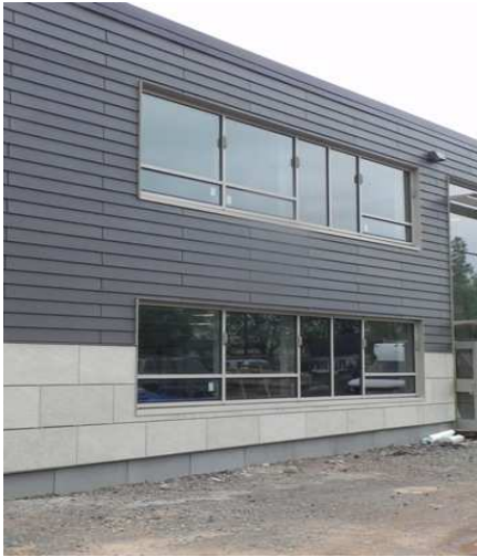
Exterior West Wall