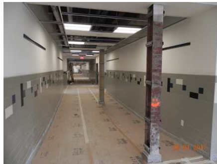
Unit J 1st Floor Corridor Terrazzo Completed