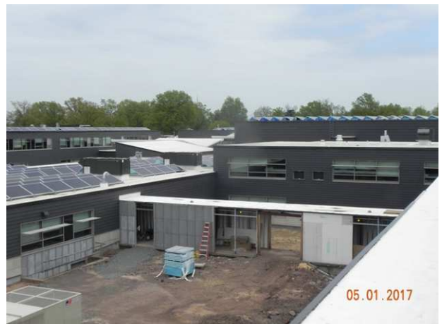
Connecting Corridor Looking at West Side

Complete Device Installation Pull Cable—Fiber and Misc. Data Low voltage wiring - F, J and lower level basement