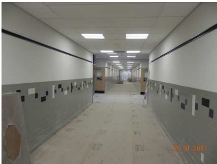
Unit J—2nd Floor Corridor—Terrazzo in Progress