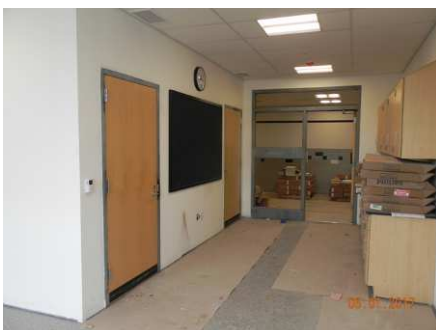
2nd Floor IPC Fixtures Installed