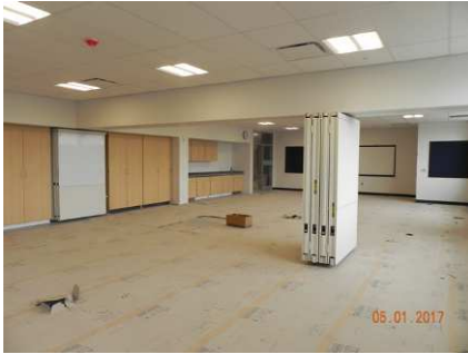
2nd Floor Double Classroom with Partition