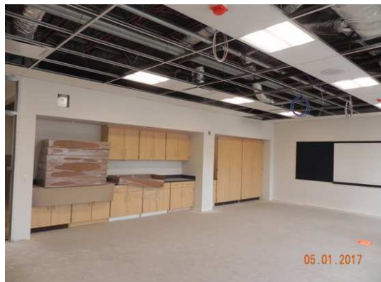
1st Floor Classroom